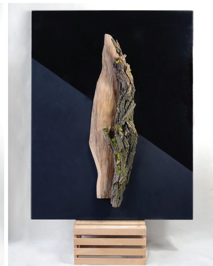
SHEATHE (2021) – 48"x 54" Organic elements, acrylic on canvas.