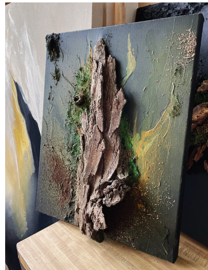
MOONLIT (2022) – 16x20" Organic elements, pastel, acrylic on canvas.