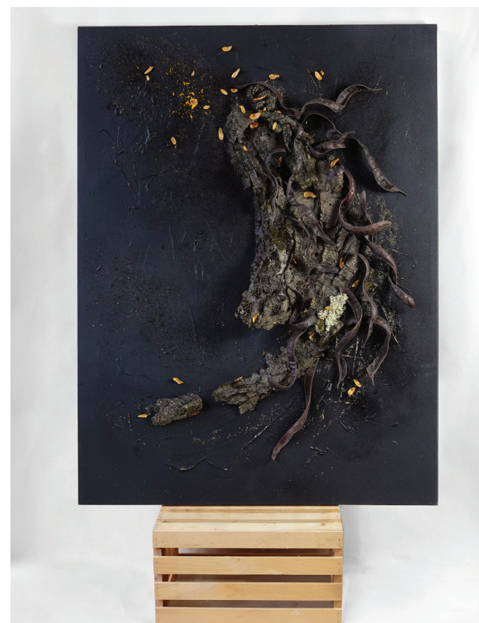
ORIGINATE (2021) – 36x48" Organic elements, acrylic on canvas.