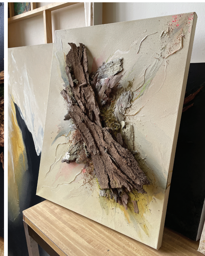
EMERGE (2022) – 22 x28" Organic elements, oil, acrylic on canvas.