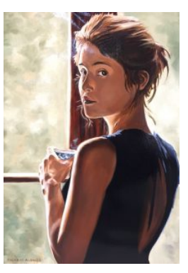
Some of the art work to be seen at the Student Show at the Birmingham Bloomfield Art Association

On going until February 28 1516 S Cranbrook Rd Birmingham