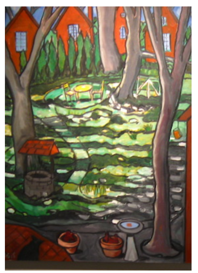
Bright colorful work and wild design!