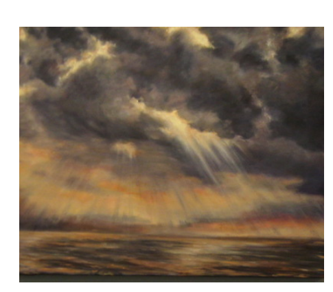
Some interesting oil on canvas art work in the dining area of the BBAC

• The Loft Fine Art is now offering 25% off the listed price for all their artworks on artsy.net . link. 222. artsy.net/show/the loft-fine art-25-percent-off-store-wide-sale